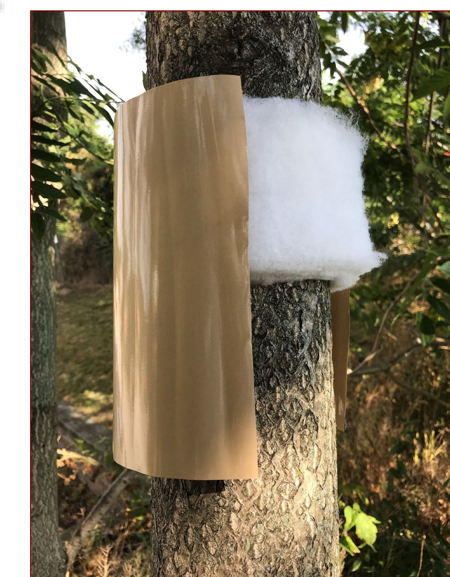
Inside a trap

For more information, check out the Invasive Species Centre webpage