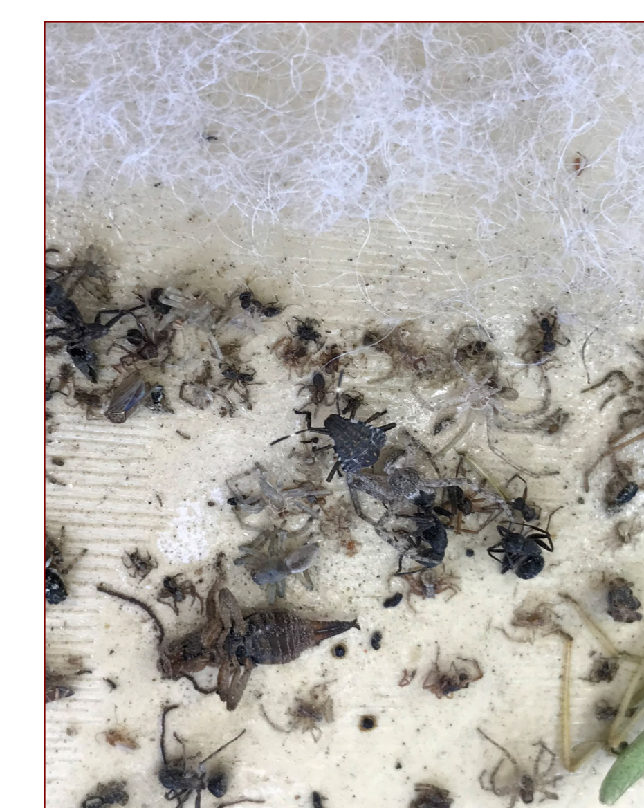
No Spotted Lanternfly here!